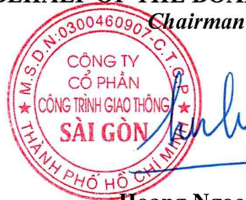
Hoang Ngoc Hung